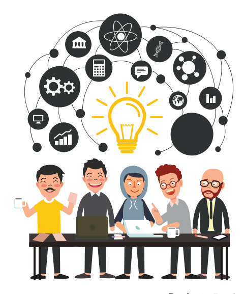
Public Business Start-ups Project Business Providers Angels Partners Experts

to close the gap between 3F and VC funding for early stage Start-ups.