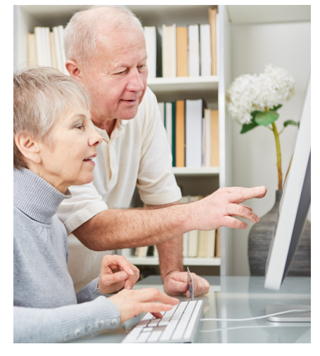
COUNTRY-BY-COUNTRY EXPERT GROUPS