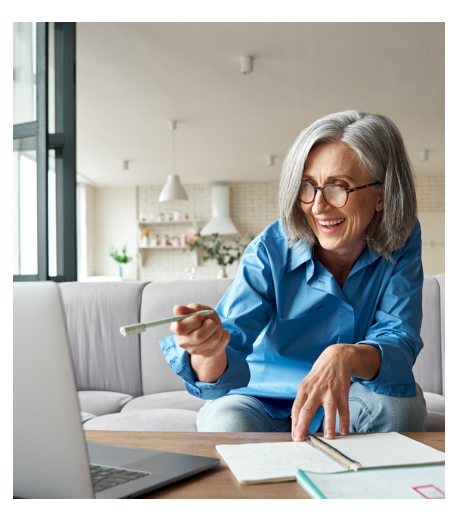
DEVELOPING EDIGISTARS STRATEGY